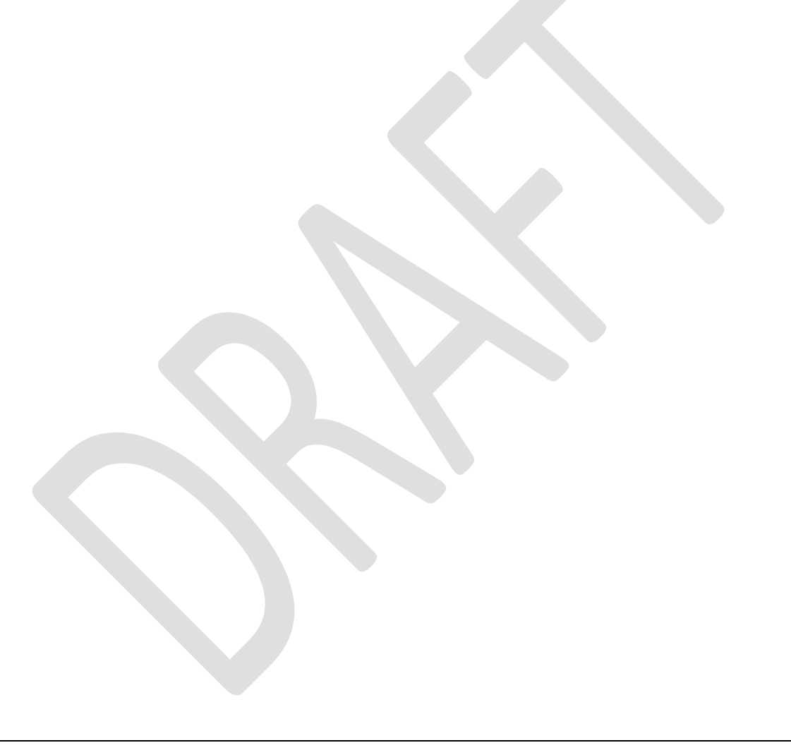
Part 2: Action Plan